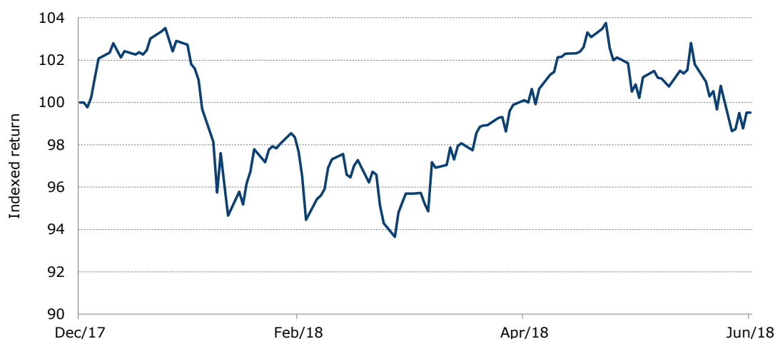
MSCI Europe Index total net return in euro

Political factors dominated the news stream. Tensions between the US and North Korea abated in the run-up to the meeting between the US President Trump and the North Korean leader Kim Jong Un. However, global markets including Europe were most concerned with the a possible trade war unfolding between the US and its key trading partners, China, the EU, Mexico and Canada. On all sides, tariffs on steel and aluminum have already been imposed. Other product imports, ranging from agricultural products to electronic components, have also been levied by the US and China, while the EU announced to do so in the coming months. Although the scope of the tariffs is still relatively limited, the markets were concerned about the danger of a continuing spiral. The sudden decline of the Chinese renminbi in June also sparked fears that the trade war will be transferred to the currency markets leading to a cascade of competitive devaluations. Financial markets, especially those of emerging countries, have already felt the impact of this scenario.